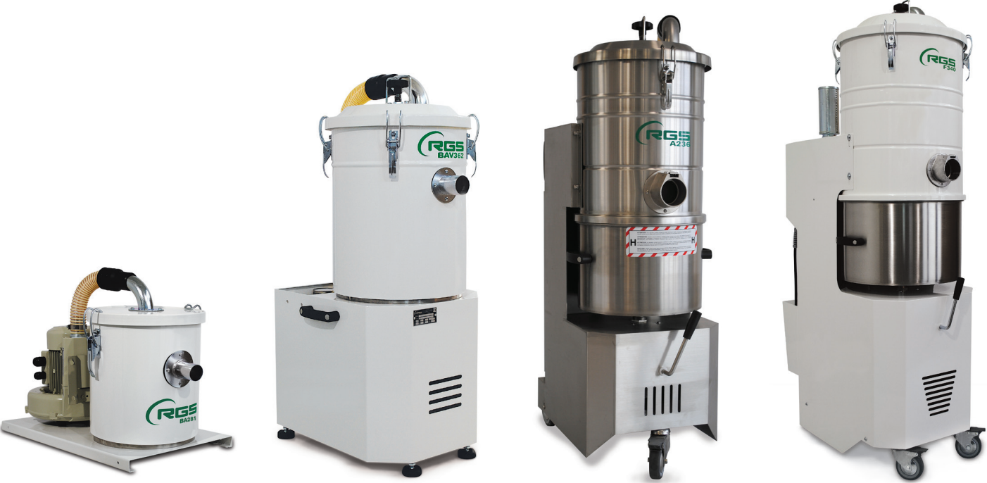
BA281 BAV362 A236X3 F340X1