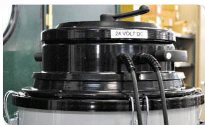
24 V single phase headboard